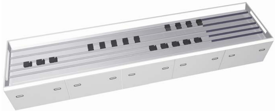
unidirectional – 4-lanes

Using the proven heat transfer technology of SMT the product is being heated from top and bottom. Cooling zones, return systems or buffer zones are optionally available.